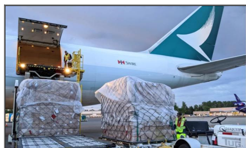
Air Freight from China to USA

SWWLS Offer Competitive Air Freight AIRPORT TO AIRPORT, DOOR-TO-DOOR shipping from China to USA, 2-8 Working days delivery with carefully selected carriers Emirates Airline (EK), Singapore Airlines (SQ), Air China (CA), etc.