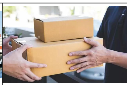
Door to Door shipping China to USA

Cheapest LCL sea freight Port to Port, Door-to-door service and shipping from China to the seaport of LOS ANGELES, LONG BEACH, SEATTLE, OAKLAND, NEW YORK, Global Coverage, fast 20-25 days delivery, get a free shipping quote now!