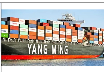
Sea Freight from China to USA

SWWLS Offer Competitive Air Freight AIRPORT TO AIRPORT, DOOR-TO-DOOR shipping from China to USA, 2-8 Working days delivery with carefully selected carriers Emirates Airline (EK), Singapore Airlines (SQ), Air China (CA), etc.