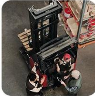
2) Pick-Up Cargo from 1 or Mutli Factory