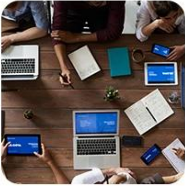
1) Offer Shipping Schedule