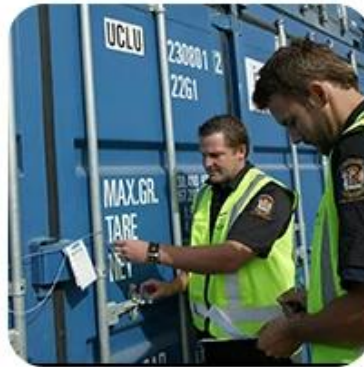
5) Export Customs Clearance