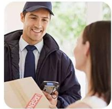
9) Delivery to Door