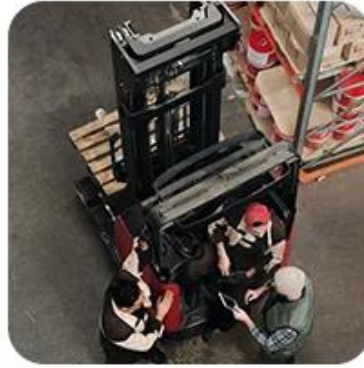
2) Pick-Up Cargo from 1 or Mutli Factory