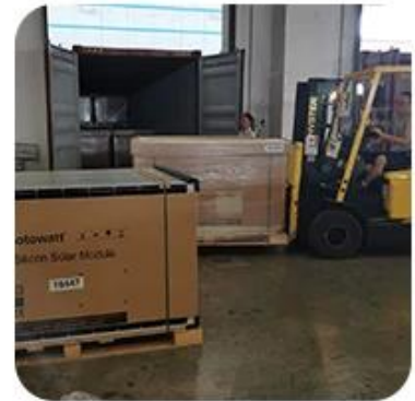
6) Loading to Container