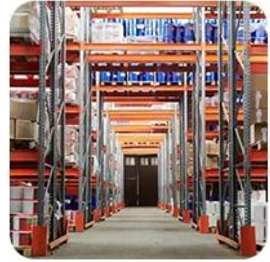
3) Delivery to Warehouse