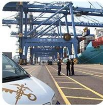
8) Import Customs Clearance