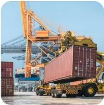
4) Loading on Boat