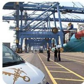
8) Import Customs Clearance