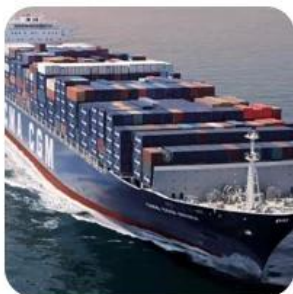
7) Shipping to Destination