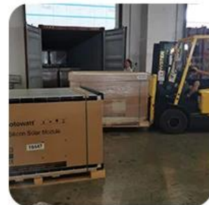
6) Loading to Container