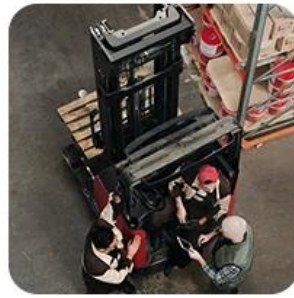
2) Pick-Up Cargo from 1 or Mutli Factory