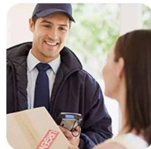
9) Delivery to Door