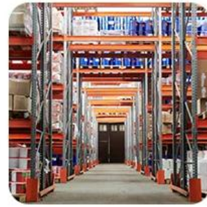
3) Delivery to Warehouse