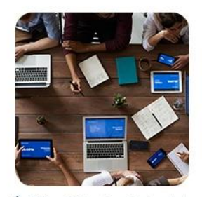
1) Offer Shipping Schedule