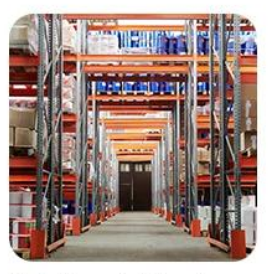
3) Delivery to Warehouse