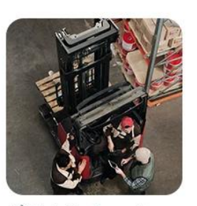
2) Pick-Up Cargo from 1 or Mutli Factory