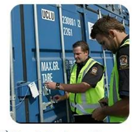
5) Export Customs Clearance 6) Loading to Container