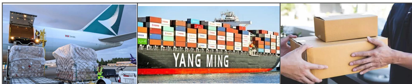
Air Freight from China to Canada SWWLS air-shipment offer reliable and flexible air freight options, whether airport-to-airport, door-to-door, or any combination. Our carriers are carefully selected to ensure the safe delivery of your goods from China to Canada.