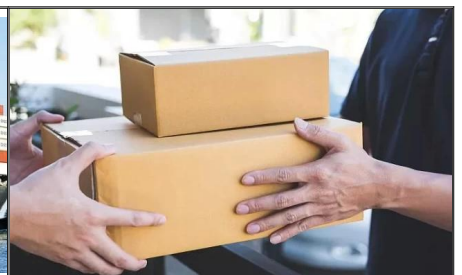
Door to Door shipping China to Australia

Affordable Port-to-Port and Door-to-Door sea freight services from China to Canadian destinations such as Vancouver, Montreal, Toronto, and more. Enjoy fast delivery within 25-35 days and receive tailored solutions.