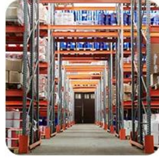
3) Delivery to Warehouse