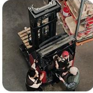
2) Pick-Up Cargo from 1 or Mutli Factory