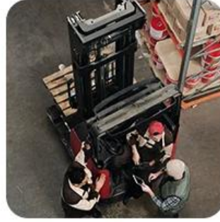
2) Pick-Up Cargo from 1 or Mutli Factory