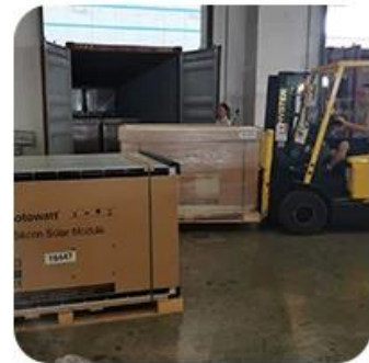
6) Loading to Container