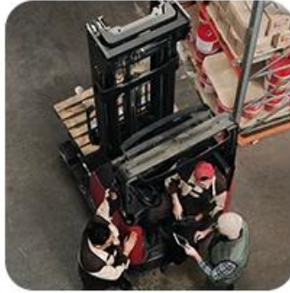
2) Pick-Up Cargo from 1 or Mutli Factory