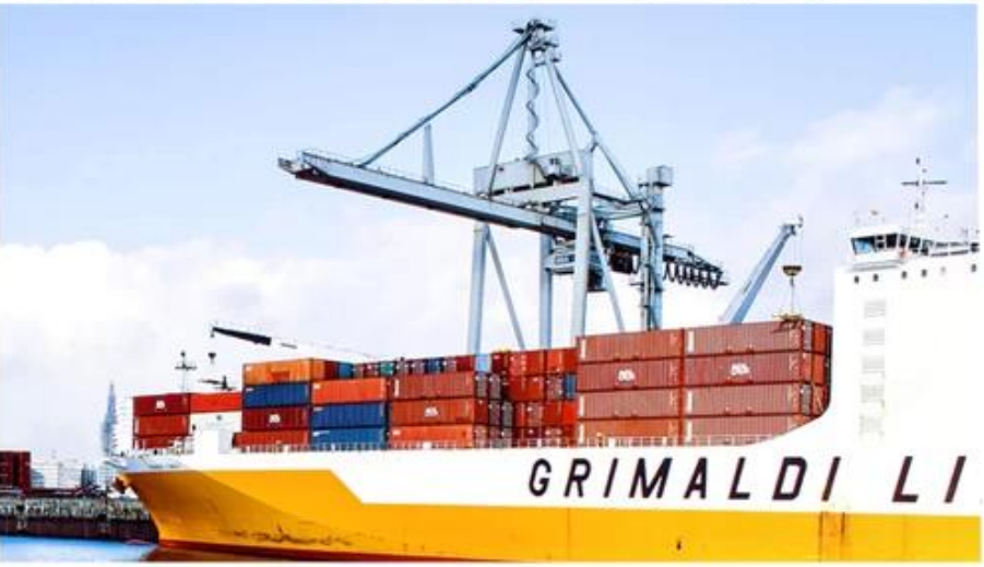
Sea / Air / Express/Door to door /Amazon shipping Consolidation cargo ( collect goods from your different suppliers and arrange as one shipment)