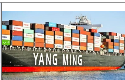
Sea Freight from China to USA

SWWLS Offer Competitive Air Freight AIRPORT TO AIRPORT, DOOR-TO-DOOR shipping from China to USA, 2-8 Working days delivery with carefully selected carriers Emirates Airline (EK), Singapore Airlines (SQ), Air China (CA), etc.